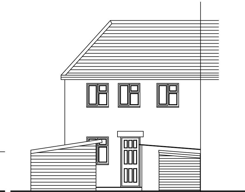
Back Elevation As Current and Proposal Direction B.